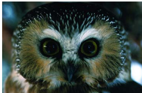
Northern Saw-Whet owl.