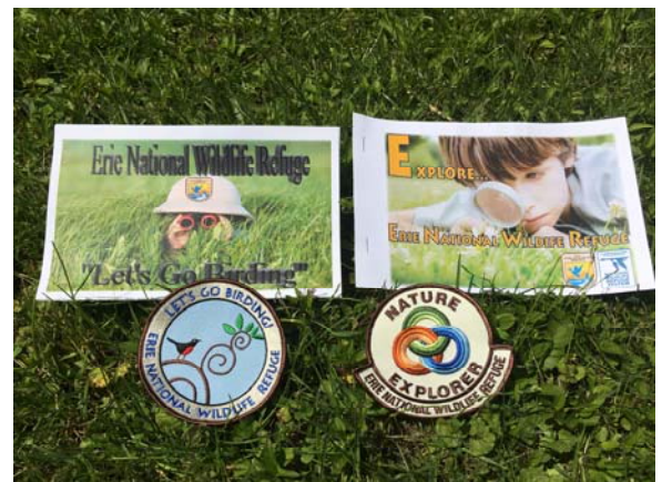
Refuge patches and booklets

Kids can earn a refuge patch by completing a booklet of activities: "Let's Go Birding" or "Nature Explorer"! You can find the booklets on our website or at the refuge visitor center.