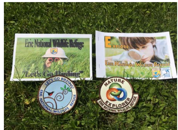
Refuge patches and booklets

Kids can earn a refuge patch by completing a booklet of activities: "Let's Go Birding" or "Nature Explorer"! You can find the booklets on our website or at the refuge visitor center.