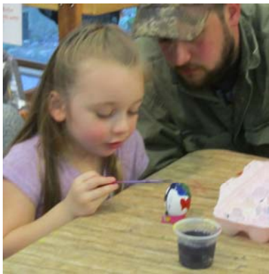
Egg painting craft